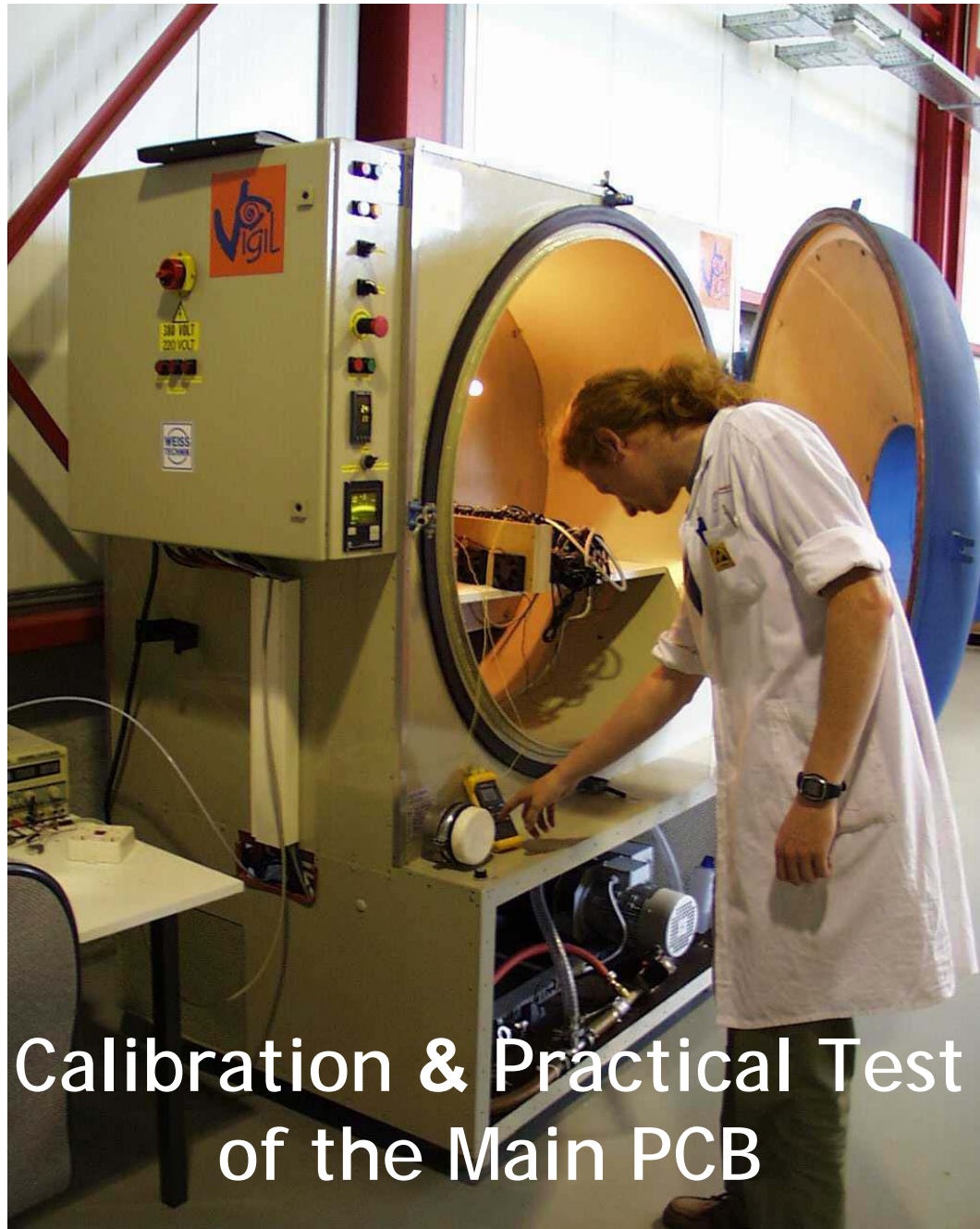
Calibration & Practical Test of the Main PCB